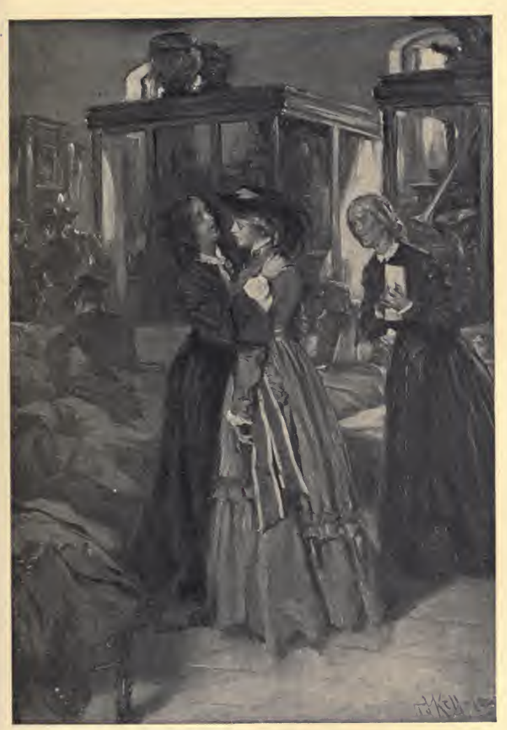
"'My sweet sister!"